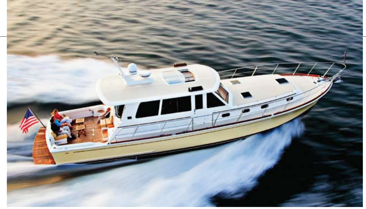
CRUISING BEAUTIES. Grand Banks' Eastbay 55 (above) is queen of the fleet, drawn by Hunt Associates. The new Sabre 40 (below) is designed inhouse and has much of the high-quality fit and finish found in the company's 52. The sedan will be launched soon; a flybridge version will follow.